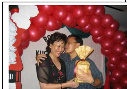
A passionate kiss from the President to his ex-girlfriend.