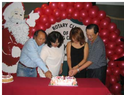
The anniversaries of 2 couples were not forgotten.