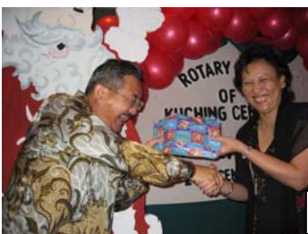
This 'squeezee' lawyer is trying his luck too hard!