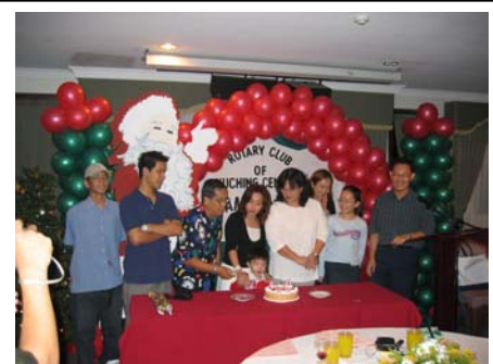
Those whose birthdays fall in the month of December were also celebrated.