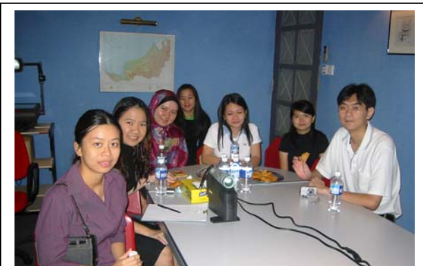
At the room where the presentation and 'talk' was conducted.