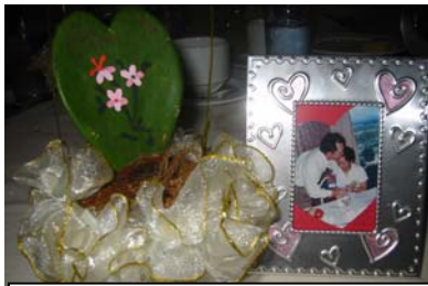
The valentine plant in the shape of a heart and a framed picture of the Rotarian & spouse in their romantic gestures.