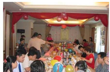
The room, decorated with balloon, flowers and candles.

requested to bring their charming spouse to come to the weekly meeting. It was definitely a pleasant surprise to the spouses because each couple was presented with a framed picture of the couple taken in a romantic snapshot. Some of the couples could not even remember when such picture was taken.