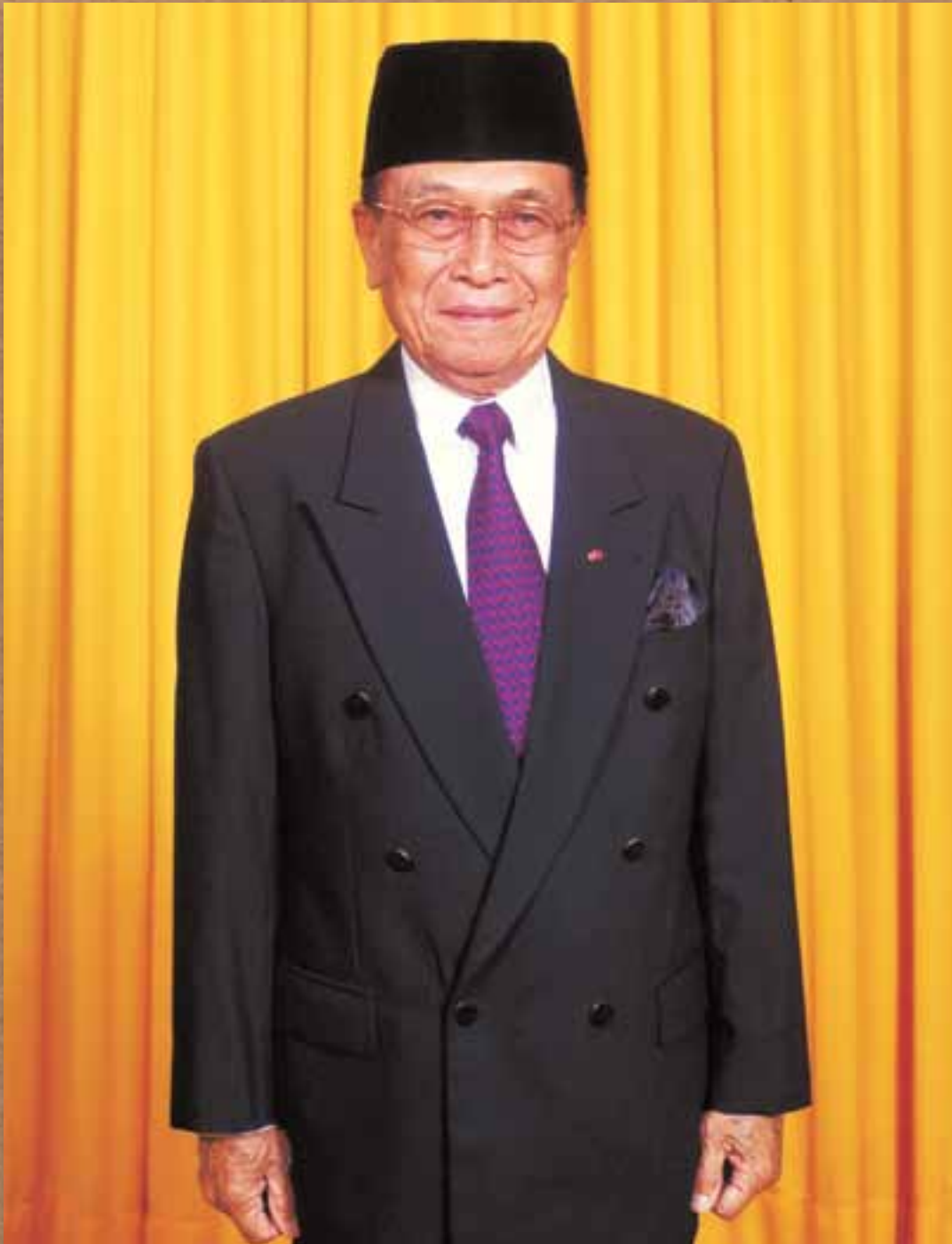
TUAN YANG TERUTAMA TUN DATUK PATINGGI ABANG HAJI MUHAMMAD SALAHUDDIN S.M.N., D.P., S.P.M.P., S.P.D.K., D.U.P.N., D.U.N.M., P.C.D. YANG DI-PERTUA NEGERI SARAWAK