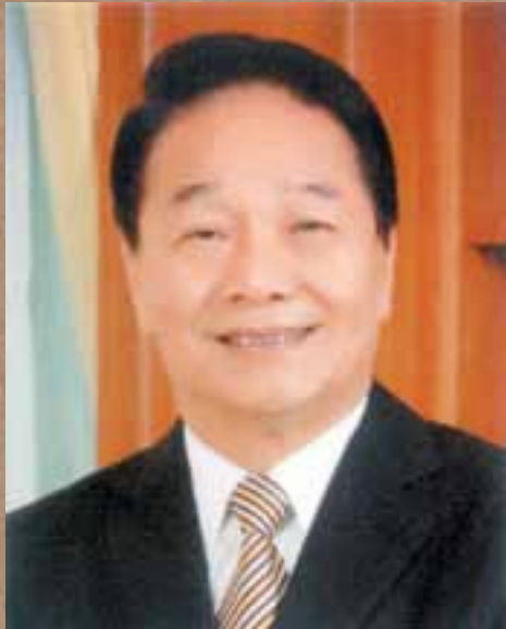
DATO SRI WONG SOON KOH Minister of Finance (II) and Minister of Local Government & Community Development, Sarawak