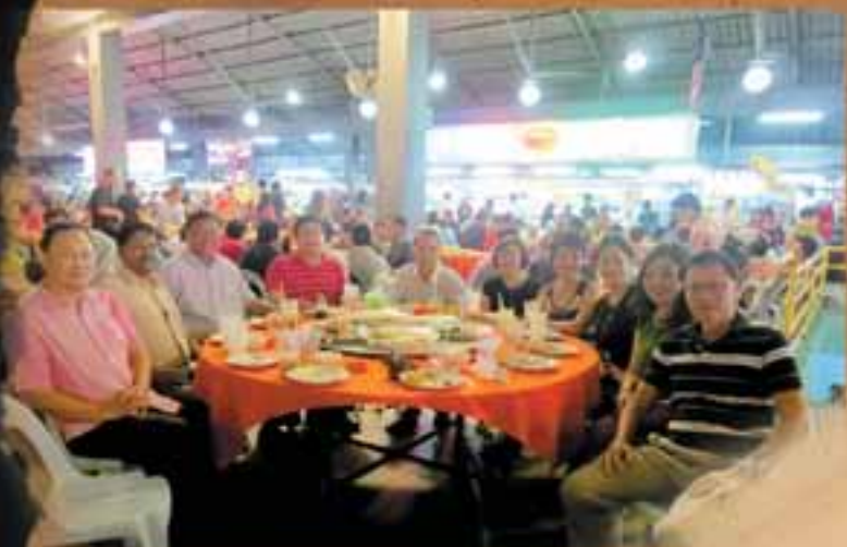
Fellowship dinner with District Governor & First Lady at Top Spot Seafood Centre.