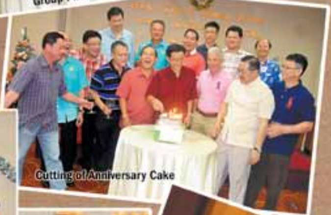
Cutting of Anniversary Cake