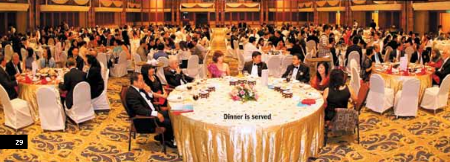
Dinner is served