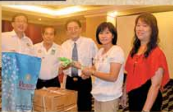
Hand over to the teacher from SJK St. Paul.