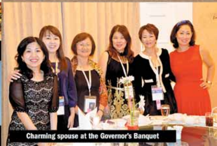
Charming spouse at the Governor's Banquet