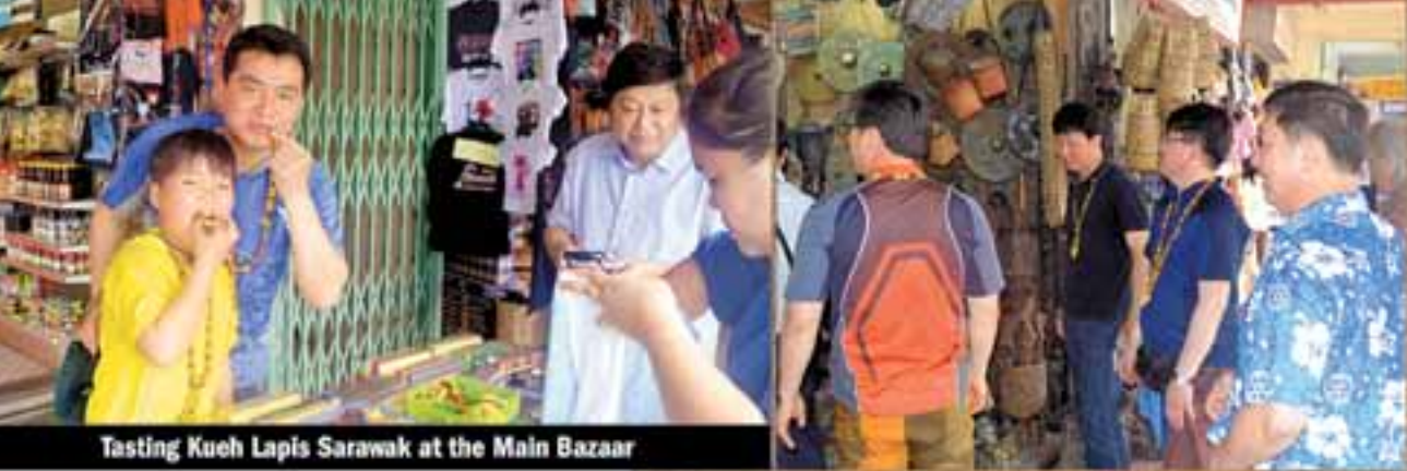
Tasting Kueh Lapis Sarawak at the Main Bazaar