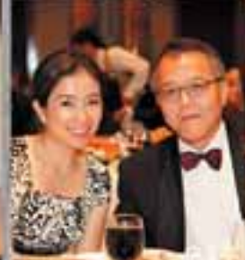
PP Aw Tai Hai & Drwin