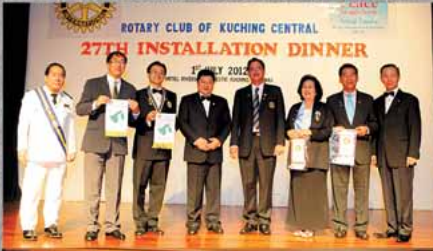
Group photo with visiting Rotarians of Sister club RC of Queenstown, Singapore

Installation Dinner was like an International Family of Rotary. We have visiting Rotarians from Singapore (sister club from RC Queenstown, Singapore), RC Bandar Seri Bagawan (Brunei) and even Indonesia. The Consul General of Indonesia and his staff were also in attendance.