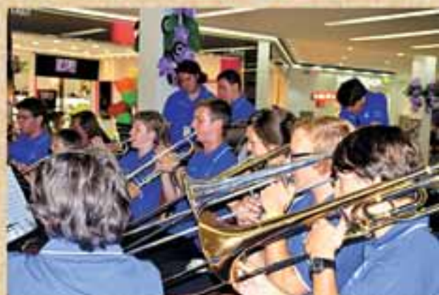
South Norfolk Youth Symphonic Band performing at the Boulevard Shopping Complex - Preview Show