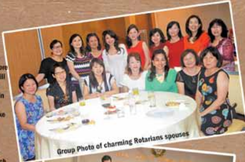
Group Photo of charming Rotarians spouses