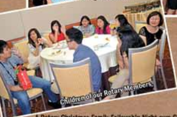
Children of our Rotary Members