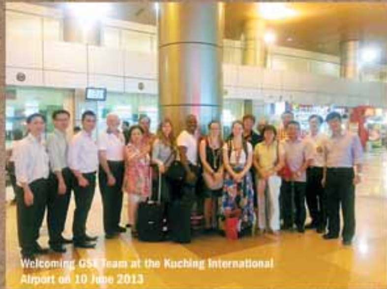
Welcoming GSE Team at the Kuching International Airport on 10 June 2013

- Hosted Group Study Exchange (GSE Team) from Nova Scotia District 7820 Canada ( 10 - 14 June 2013)