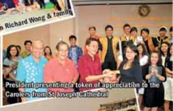
President presenting a token of appreciation to the Carolers from St Joseph Cathedral