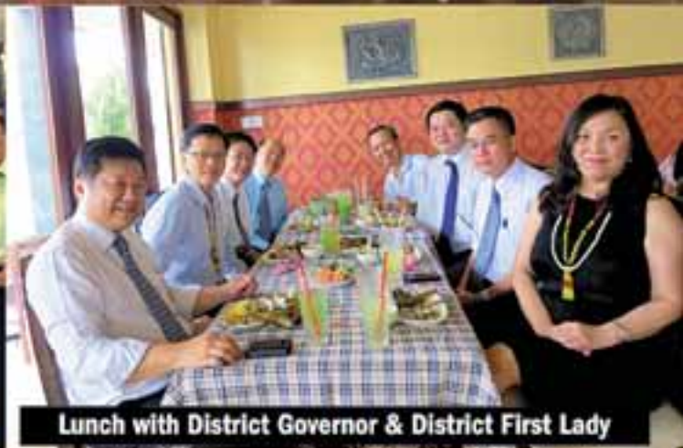
Lunch with District Governor & District First Lady