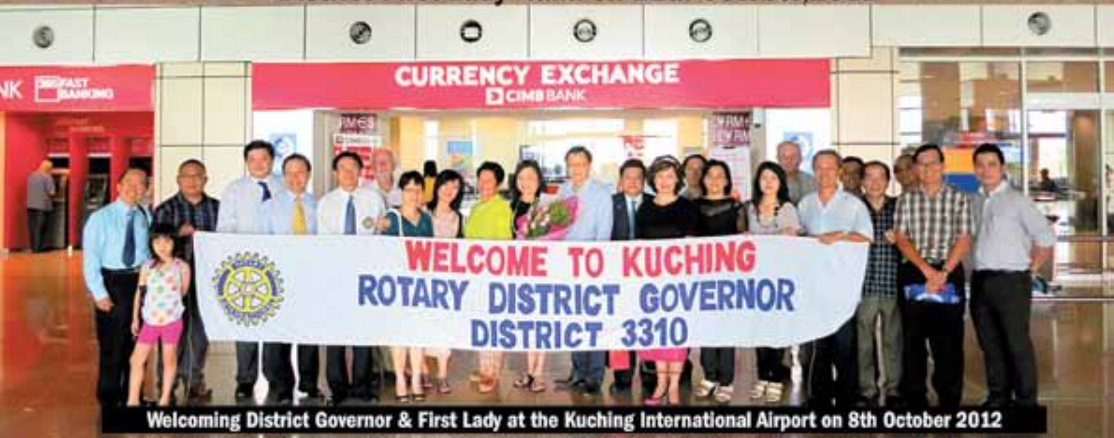
Welcoming District Governor & First Lady at the Kuching International Airport on 8th October 2012