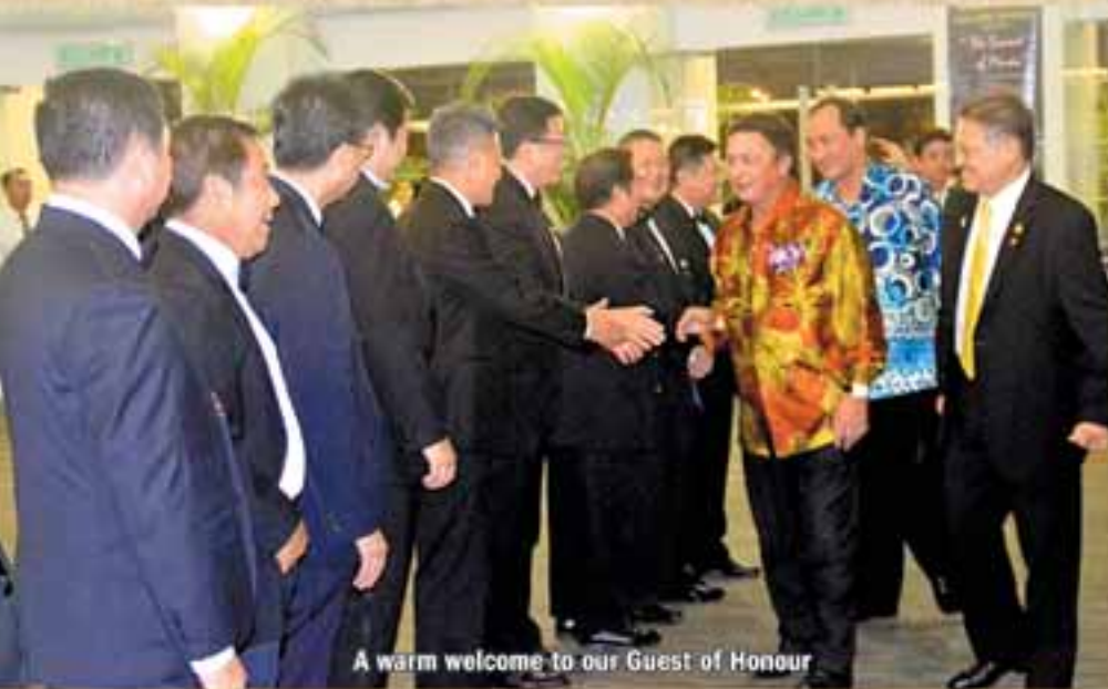
A warm welcome to our Guest of Honour