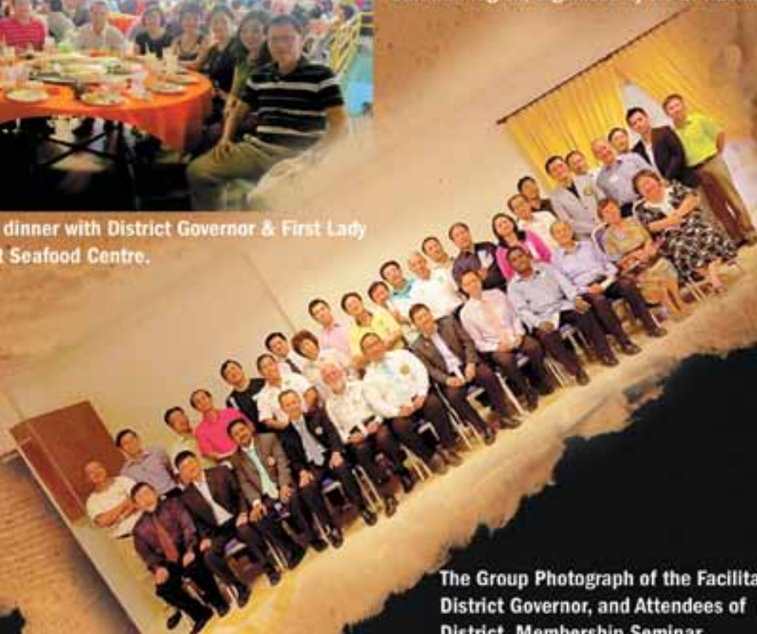
The Group Photograph of the Facilitators, District Governor, and Attendees of the District Membership Seminar.