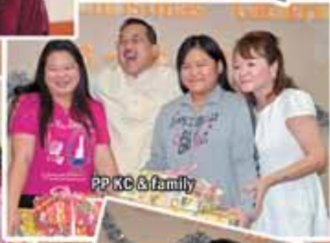
PP KC & family