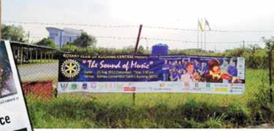
One of the banners advertising the concert