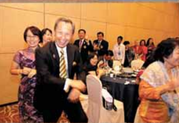
PSY - Gangnam Style Featuring DGN Andre

@ the District Assembly Spouse Programme