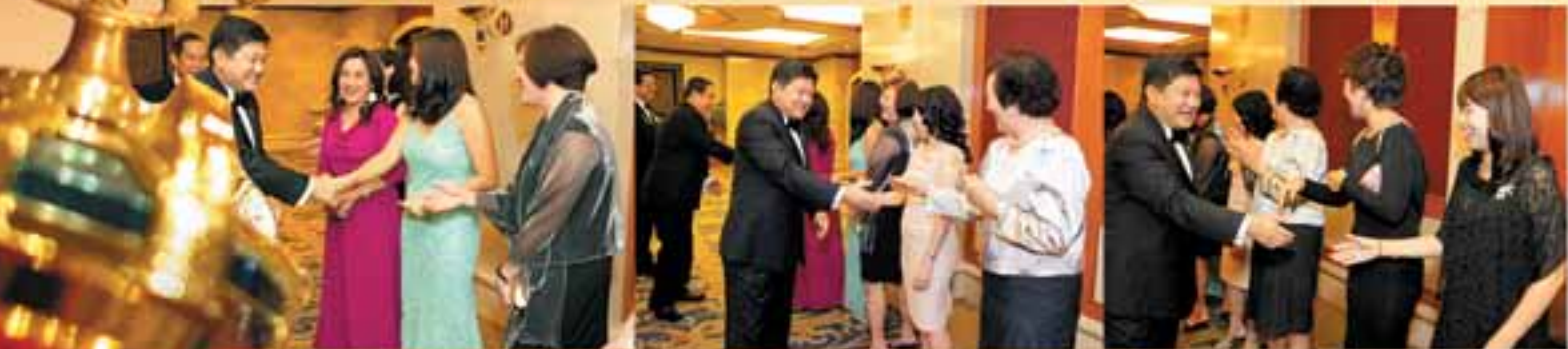
Warm greetings from our charming Rotarian spouses