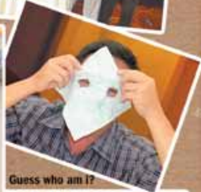
Guess who am I?