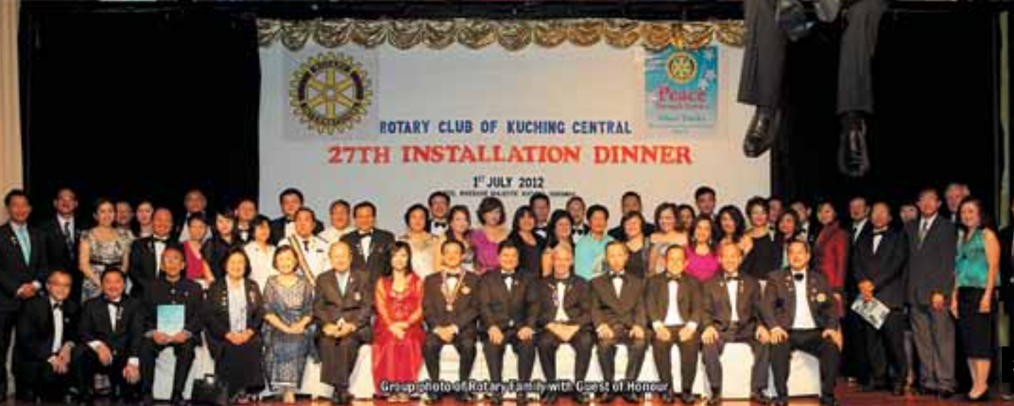
Group photo of Rotary family with Guest of Honour