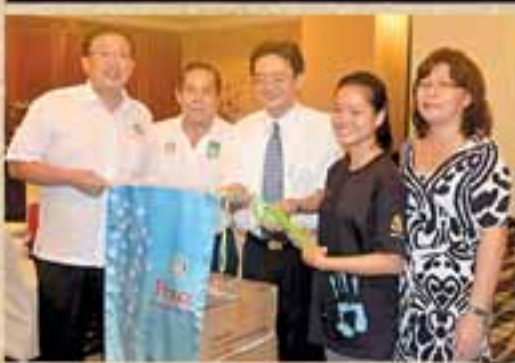
Hand over to the Interact Club SMK Kuching High.