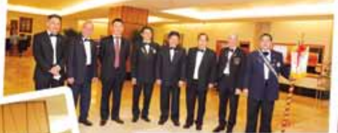
Full attention at the hotel lobby