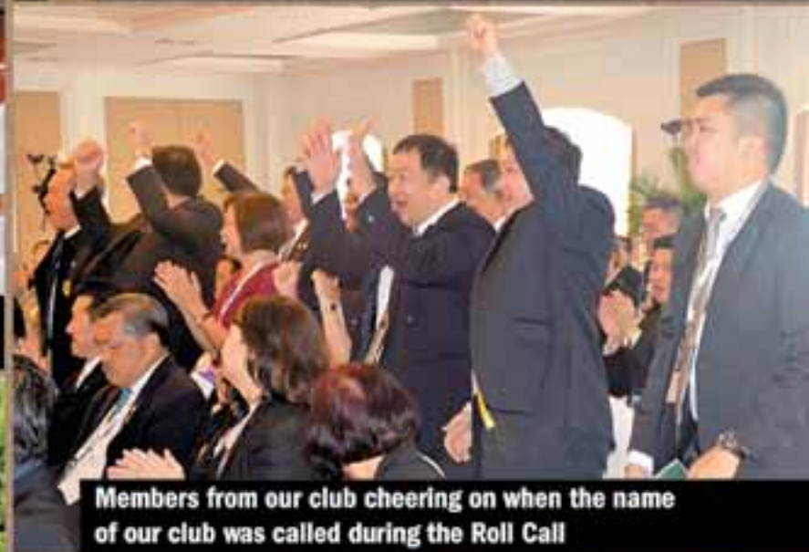
Members from our club cheering on when the name of our club was called during the Roll Call