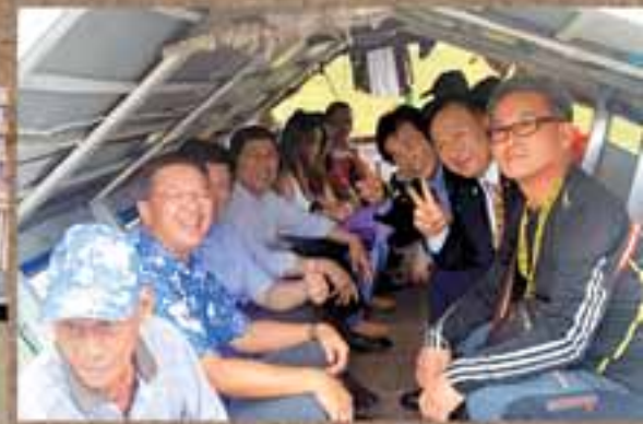
Sampan ride to Kuching Waterfront