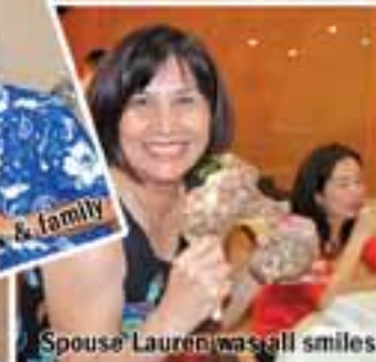
Spouse Lauren was all smiles