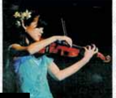
A young girl playing the violin during a performance.