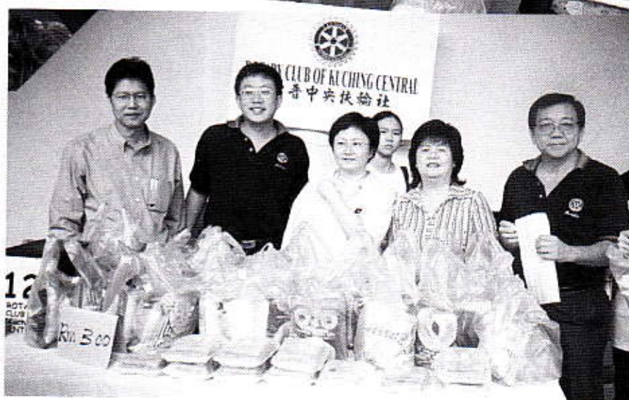
That it is ..... From Rotary Club of Kuching Central.