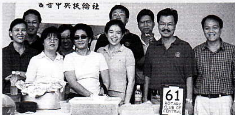
A group photograph taken at the sale.