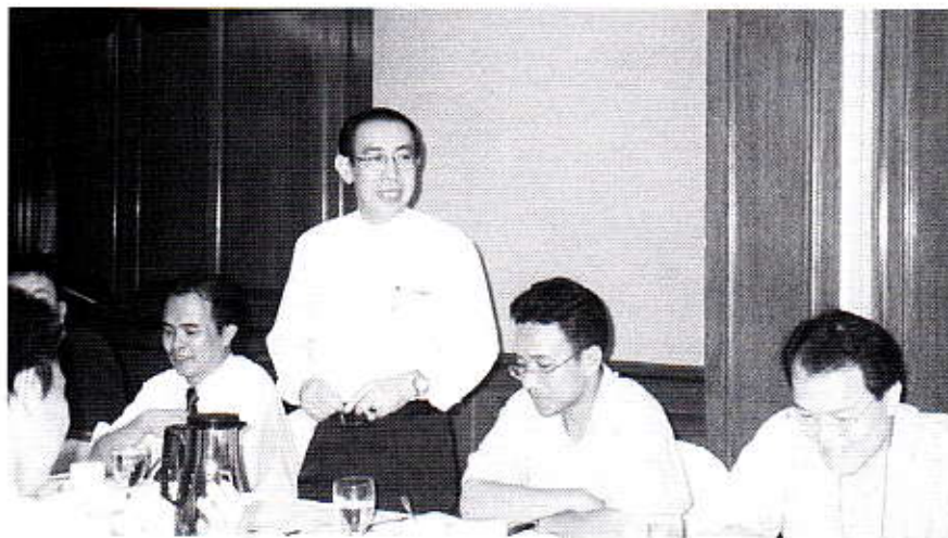
The protem Secretary and his members attended our club meeting.