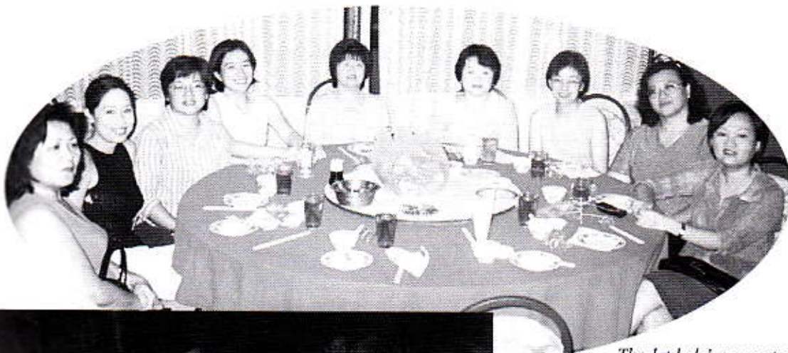
The 1st lady's supporters.