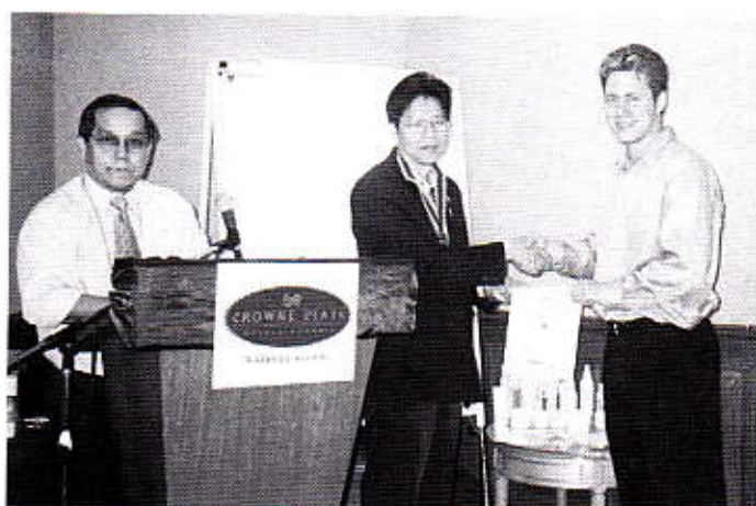
From New Zealand.