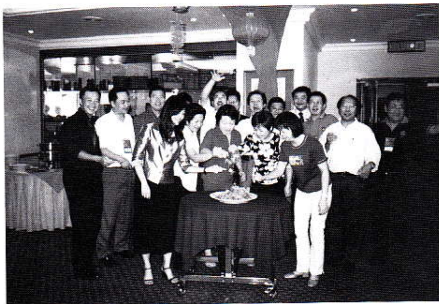
On the 15th day of Chinese Lunar Calendar the Rotarian and Spouse were having "Yee San" at one of the weekly meeting