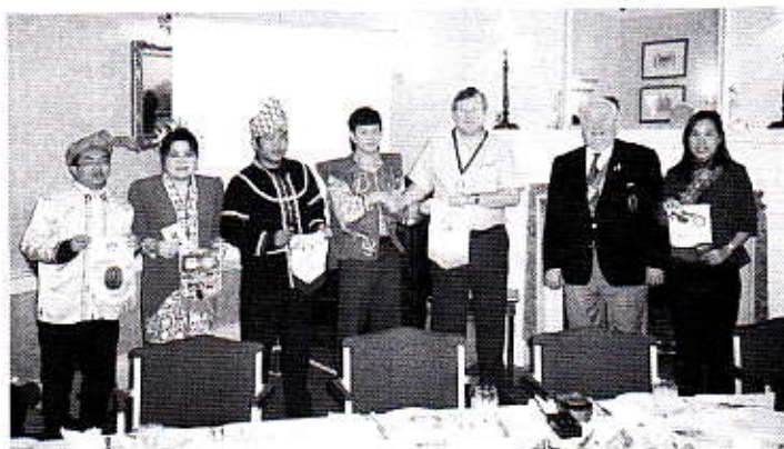
Presentation to Steyning & Henfield Club.