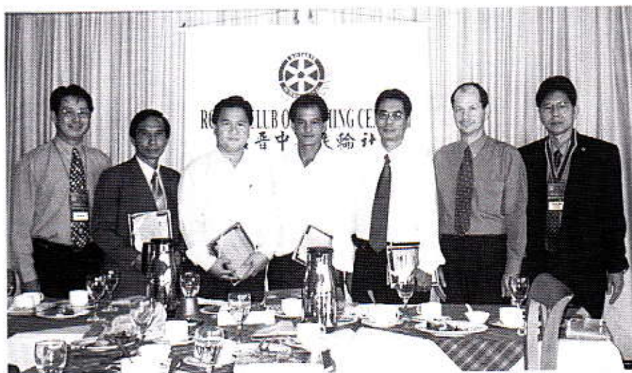
Vocational service awards presentation.