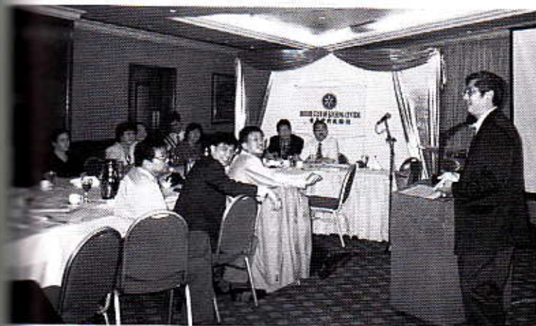
Speaker from Kuala Lumpur.