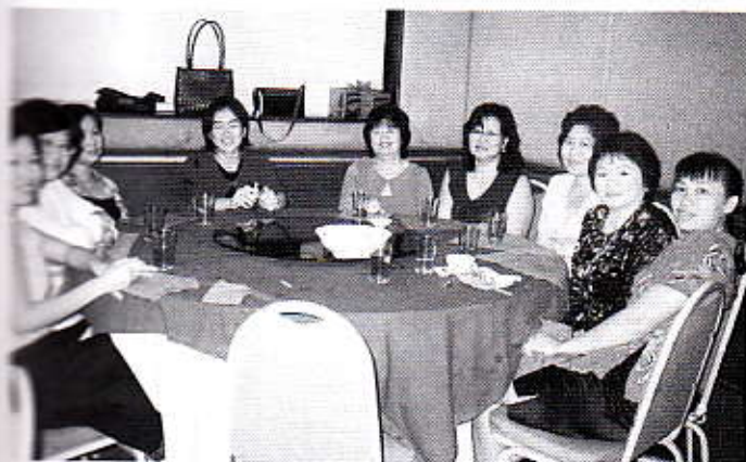
At the Sarawak Club.