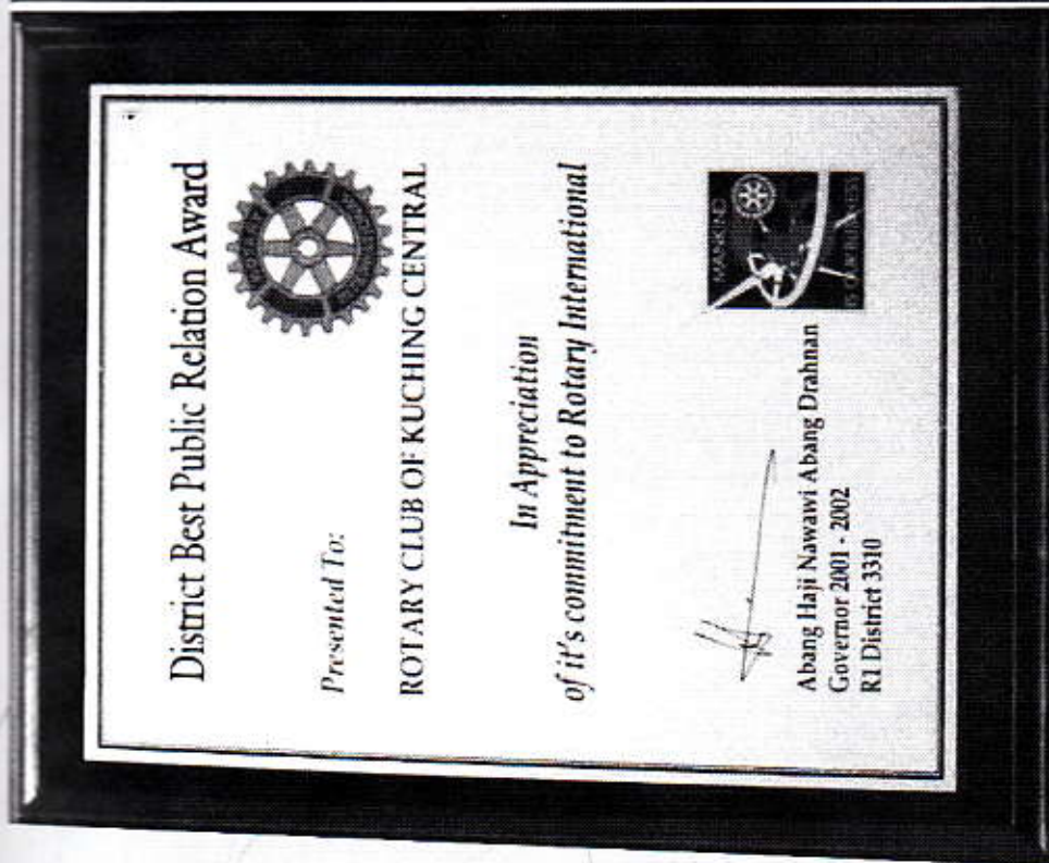
(a) District Best Public Relation Award