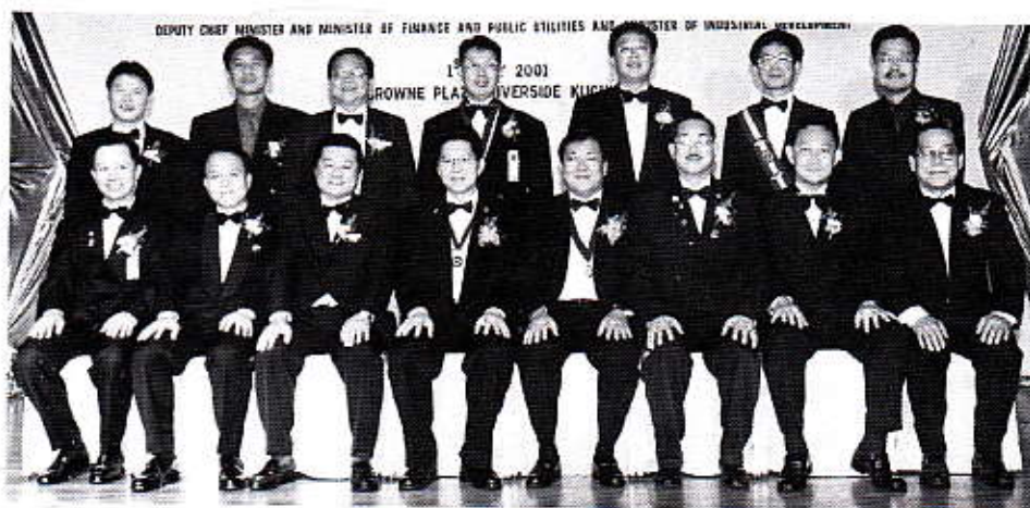
Members of the Board of Directors for the Rotary year 2001-2002.