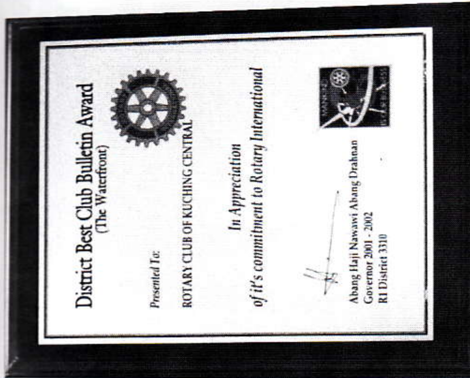
(b) District Best Club Bulletin Award