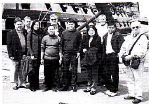
With Rotarian of Littlehampton Club

The team had the opportunity to engage in discussions and gained much knowledge from the vocational and cultural experience. They met diverse and interesting people, in particular Rotarians from the district making some good friends.