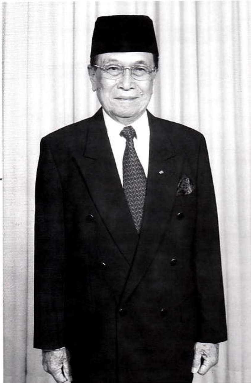
TUAN YANG TERUTAMA TUN DATUK PATINGGI ABANG HAJI MOHAMAD SALAHUDDIN S.M.N., D.P., S.P.M.P., S.P.D.K. YANG DIPERTUA NEGERI SARAWAK