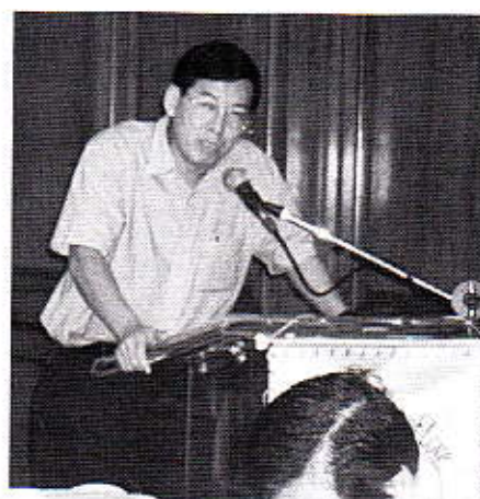
Speaker from Kuching Club.