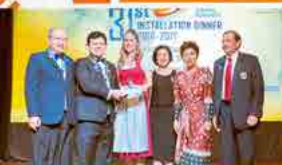
Thank you to the Rotary Club of Hong Kong.