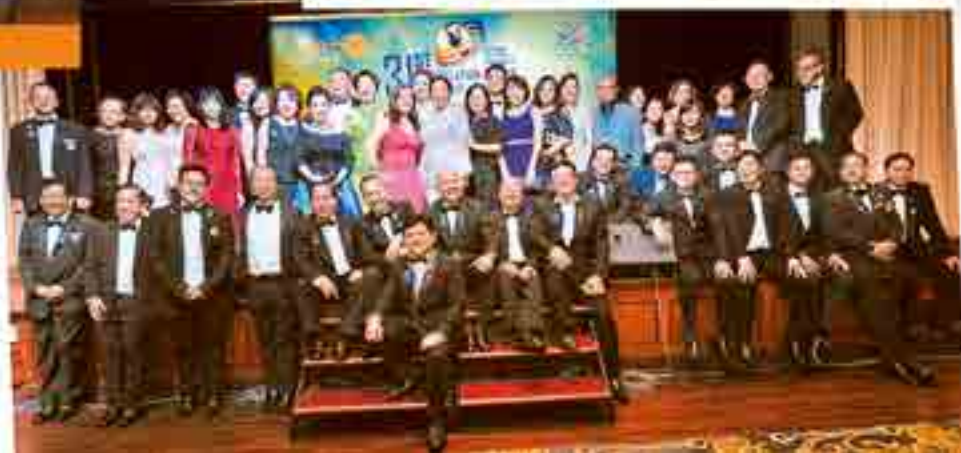
Thank you to the Rotary Club of Hong Kong.