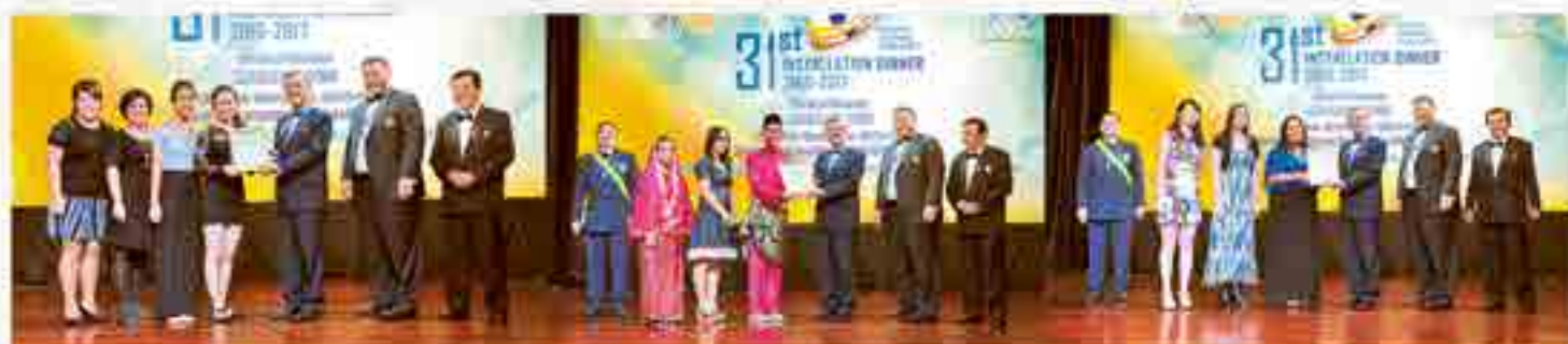
All honorees and members of the Rotary Club on stage