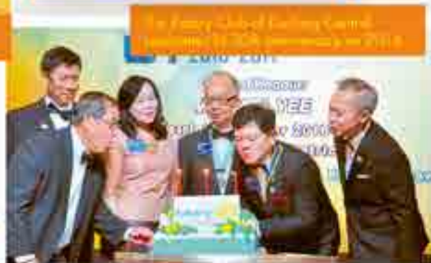
The Rotary Club of Hong Kong.