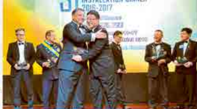
Group photo of the 31st Installation Dinner 2016-2017