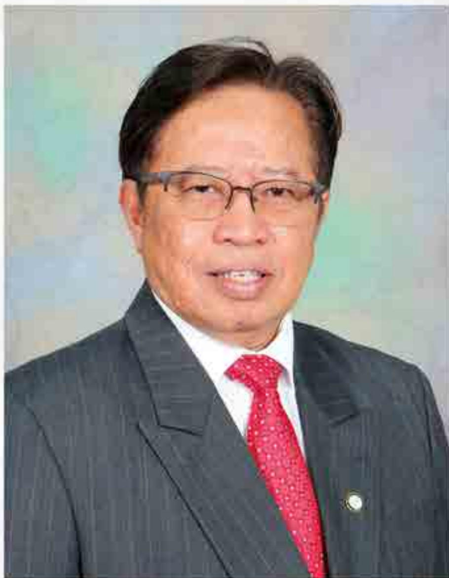
YANG AMAT BERTHORMAT DATUK AMAR ABANG HAJI ABDUL RAHMAN ZOHARI BIN TUN DATUK ABANG HAJI OPENG