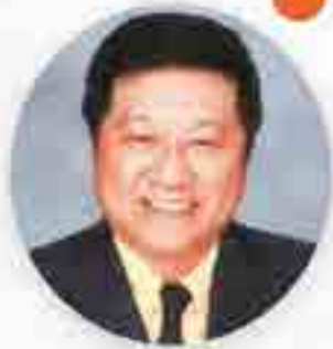
PP KHO PING