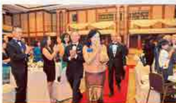
Guests of honor at the 31st Installation Dinner 2016-2017.