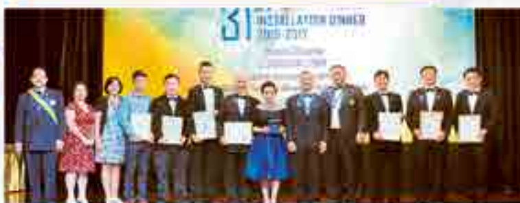
Women of the Rotary Club on stage