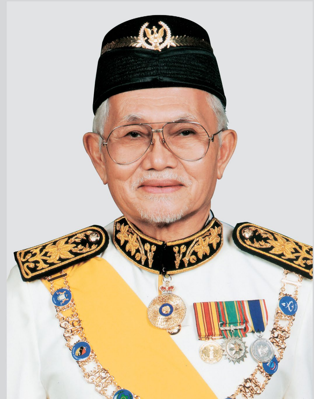
TUAN YANG TERUTAMA TUN PEHIN SRI HAJI ABDUL TAIB MAHMUD

S.M.N., S.B.S., D.K. (JOHOR), D.K. (BRUNEI), D.K. (PAHANG), S.P.D.K., S.U.M.W., S.S.D.K., D.G.S.M., D.P.P.N., S.S.S.A., S.P.M.T., KT. WE. (THAILAND), KEPN (INDONESIA), K.O.U. (KOREA), AO (AUSTRALIA), P.P.K.