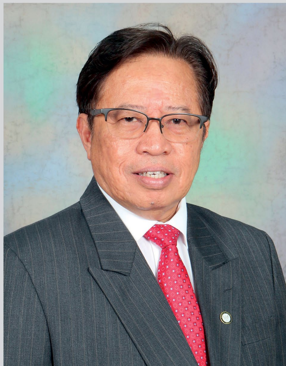
YANG AMAT BERTHORMAT DATUK PATINGGI (DR) ABANG HAJI ABDUL RAHMAN ZOHARI BIN TUN DATUK ABANG HAJI OPENG